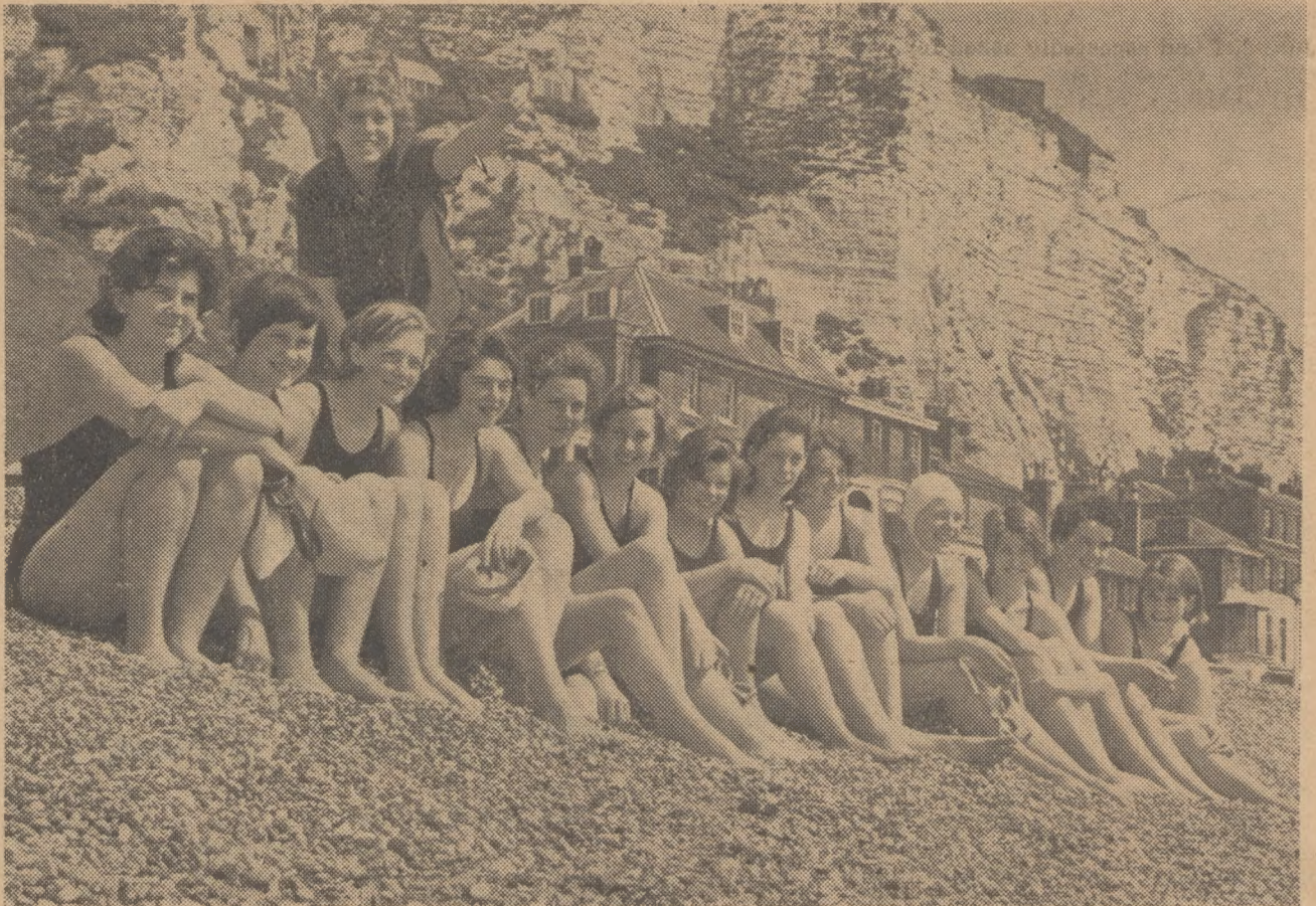
On the white cliffs of Dover the above girls are seen sunning themselves. This in itself is nothing special. What is special about it is that they were about to partake in a swim-relay across the Channel. The girls are pupils of a London school for girls. Under the guidance of their gymn teacher they had already trained in the sea. They were to swim not more than three miles each.